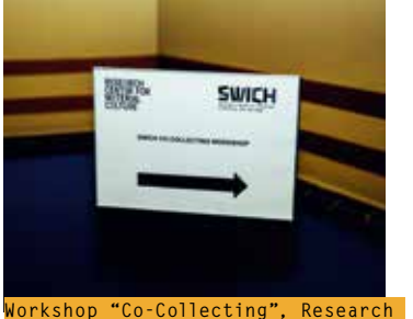
Center for Material Culture (NL).

In a number of activities, the SWICH partner museums work on methods for a futureoriented museum practice. In differing settings questions concerning citizenship and belonging, collaborative exhibition practices, innovative artistic interventions or the impact of digital technology on future collecting are discussed.