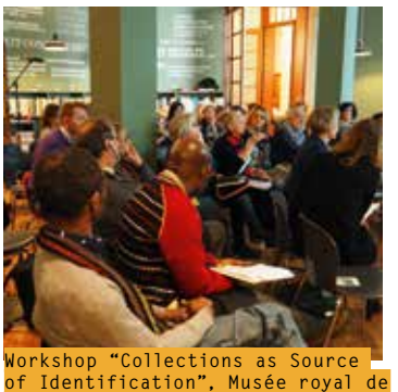
l'Afrique centrale (BE).

To enable in-depth research for artists and researchers external to the institutions. the museums organize various residencies. The topics "Outside In - Illuminating Guests" and "Co-Creation Labs" guide the guests through their stay in the respective city. The outcome of each residency is defined by the museums themselves and can take the form of an exhibition. a performance, a website or any other experimental format.